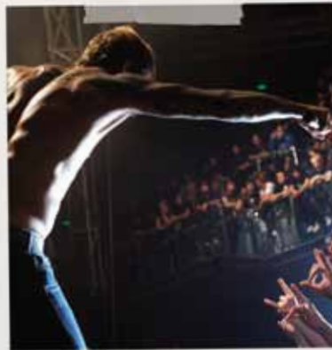
KISS MY CAMERA 09