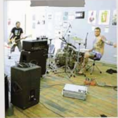
LOVE IS MY VELOCITY BANK NOTES 09